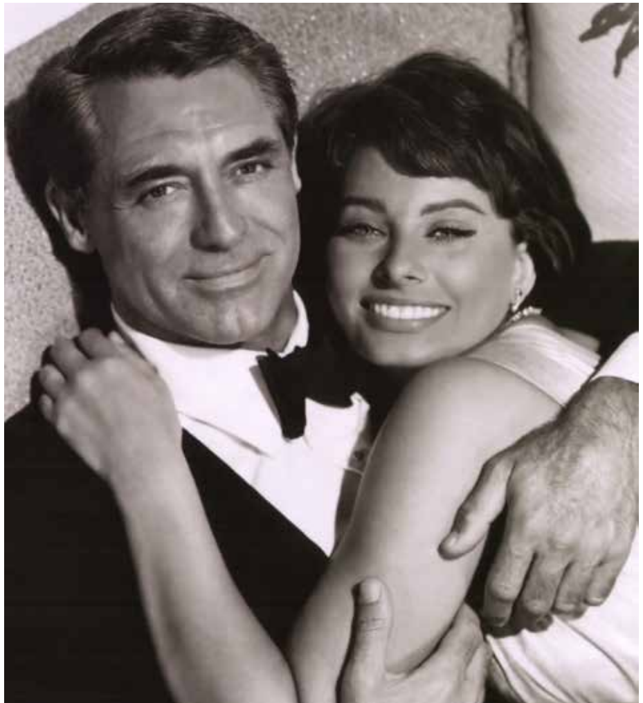
Sophia Loren starred with Cary Grant in the movie "Houseboat" in 1958

And so, in writing, it came with many thoughts and things that happened to me during my work. I wanted to share it also with the people who went to see