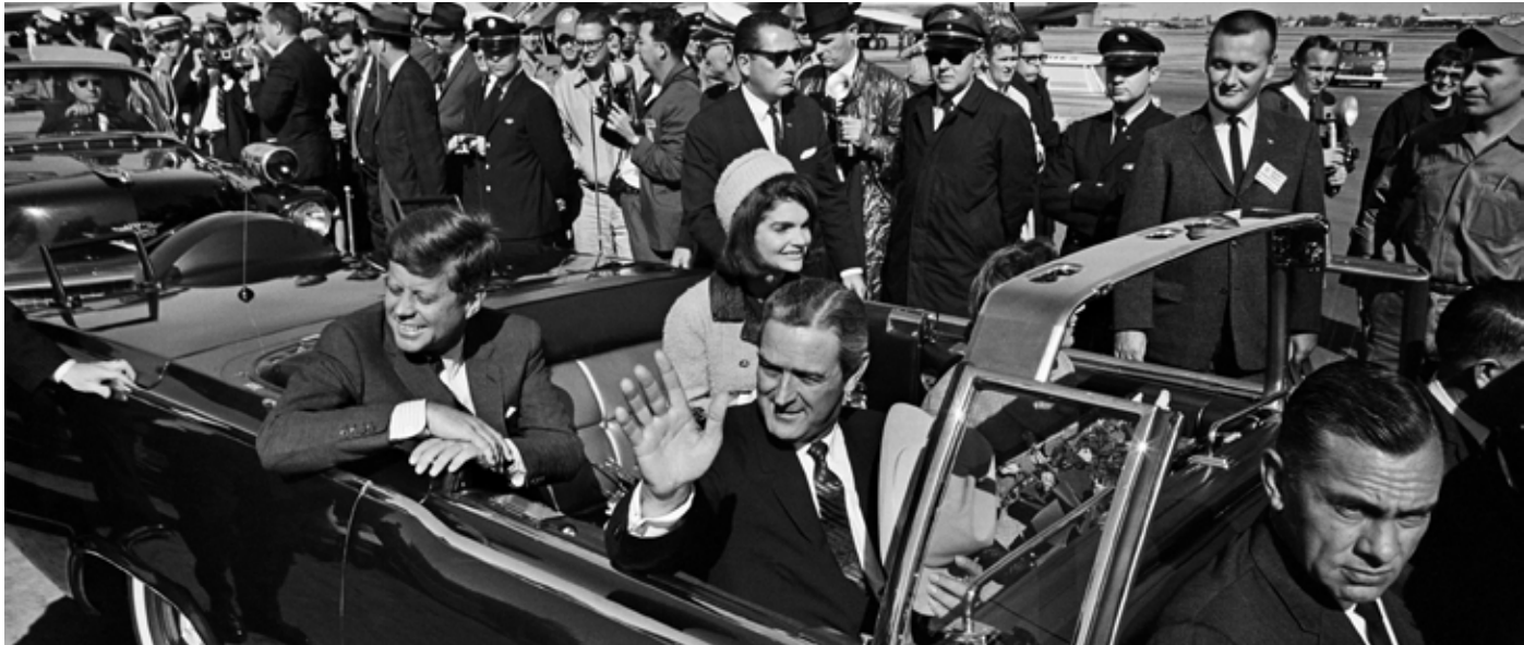
50 years ago a 10-mile drive through Dallas and a speech on national security at the Trade Mart awaited President John F. Kennedy, as he, first lady Jacqueline Kennedy, Texas Gov. John Connally and Nellie Connally, departed Love Field on Nov. 22, 1963. Less than a hour later, three gunshots would shatter the president's plans, and plunge the nation into profound grief.