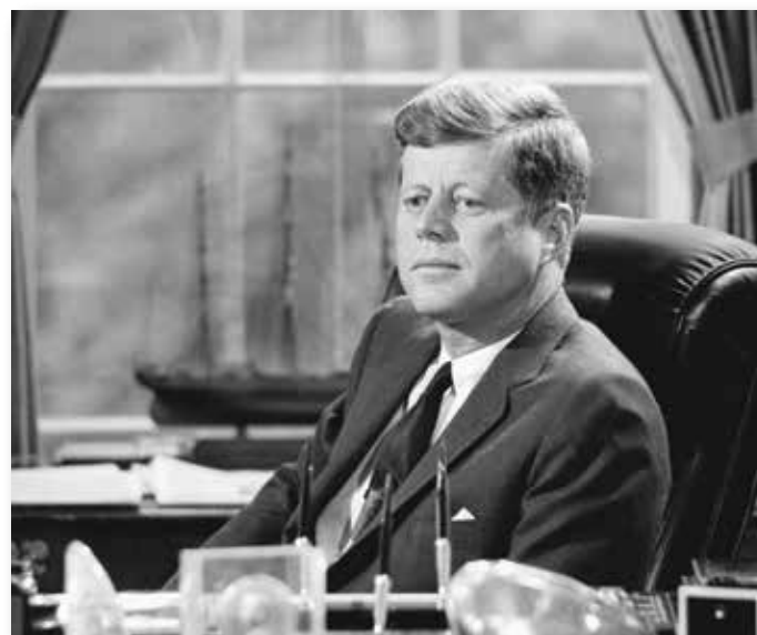
John Fitzgerald Kennedy in the oval office (circa 1961)

I wonder what it took, in light of your numerous physical disabilities to step up to the prospect of changing the landscape of the nation, the world, and the space.